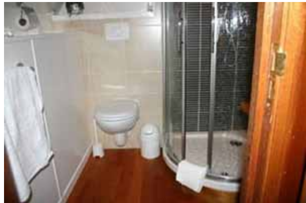
A view of an en-suite bathroom