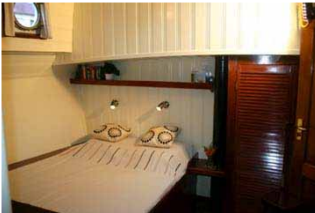
The cabins provide the comfort and charm for your cruise